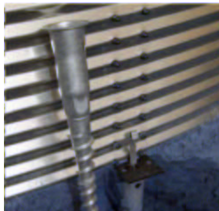
Ground anchor for installation.