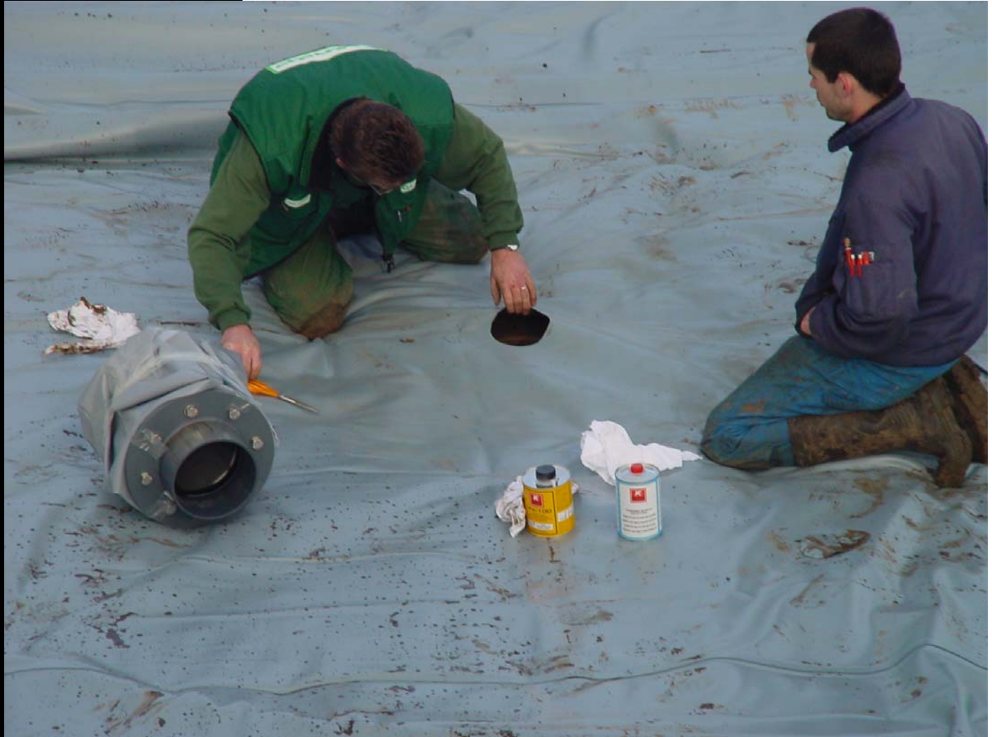
Preparation for connections clamp flange and throttle cap