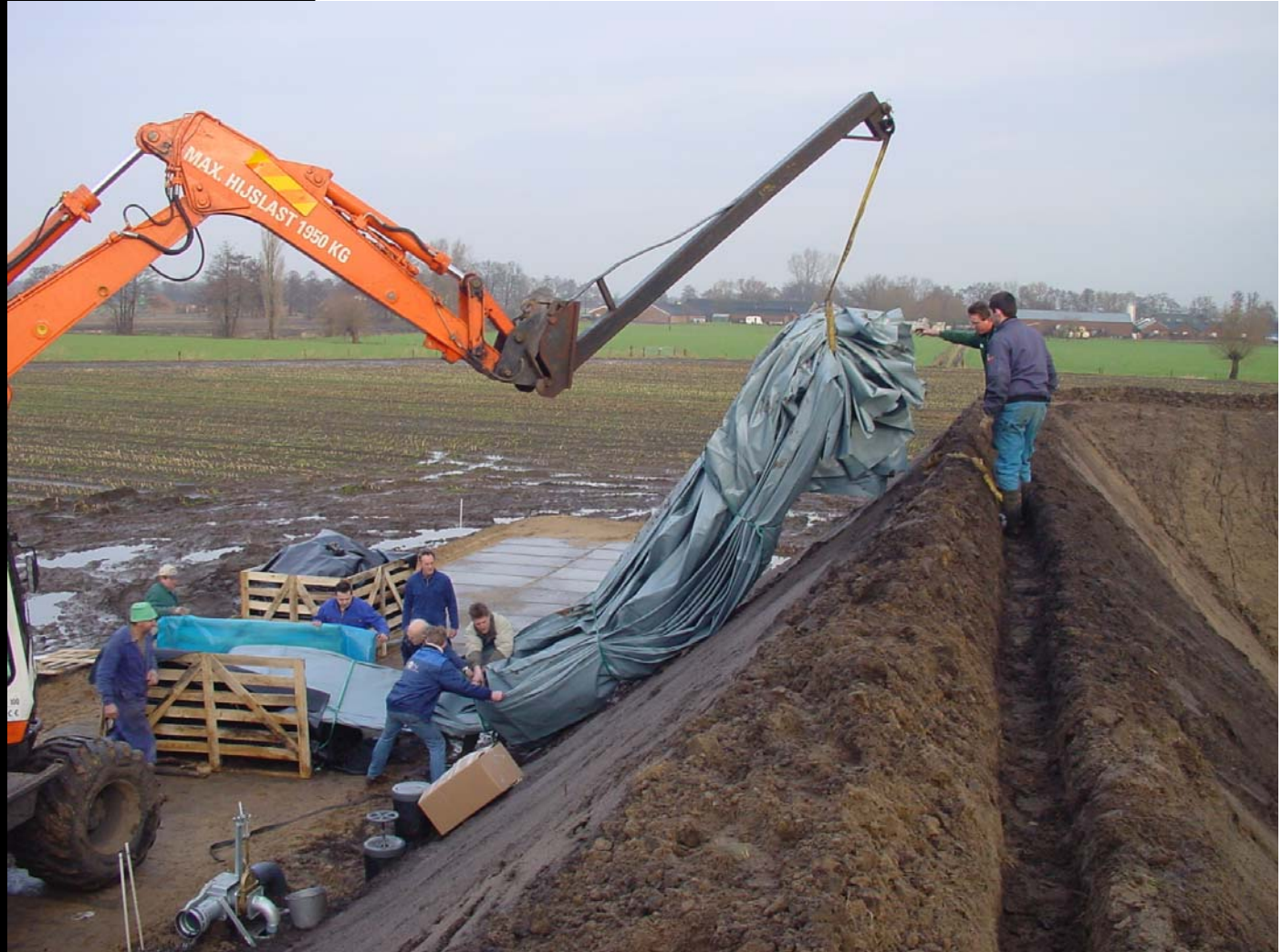
Unloading the Fecatex sheet from the crate