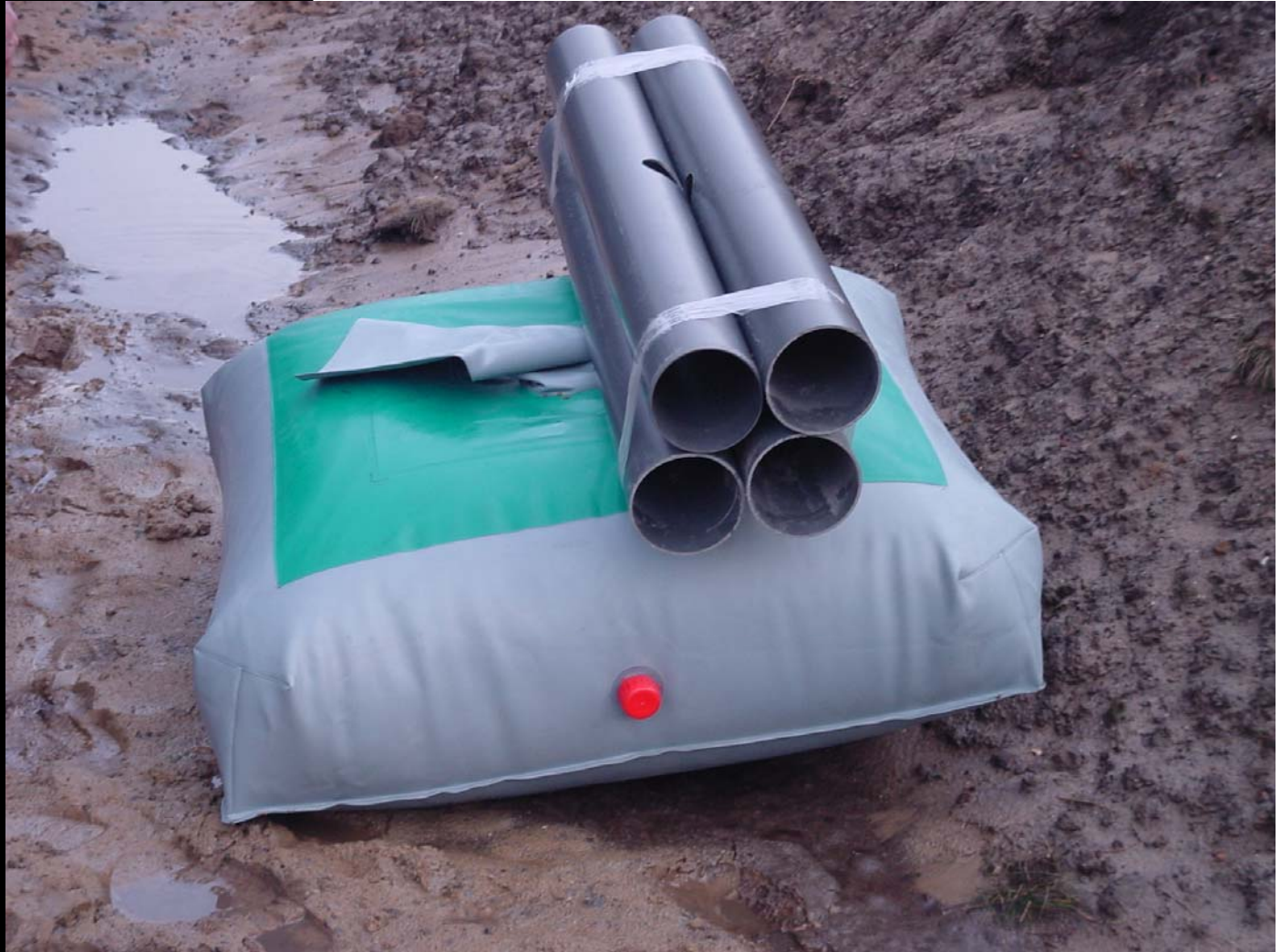
Degassing–floating cushion and accessories