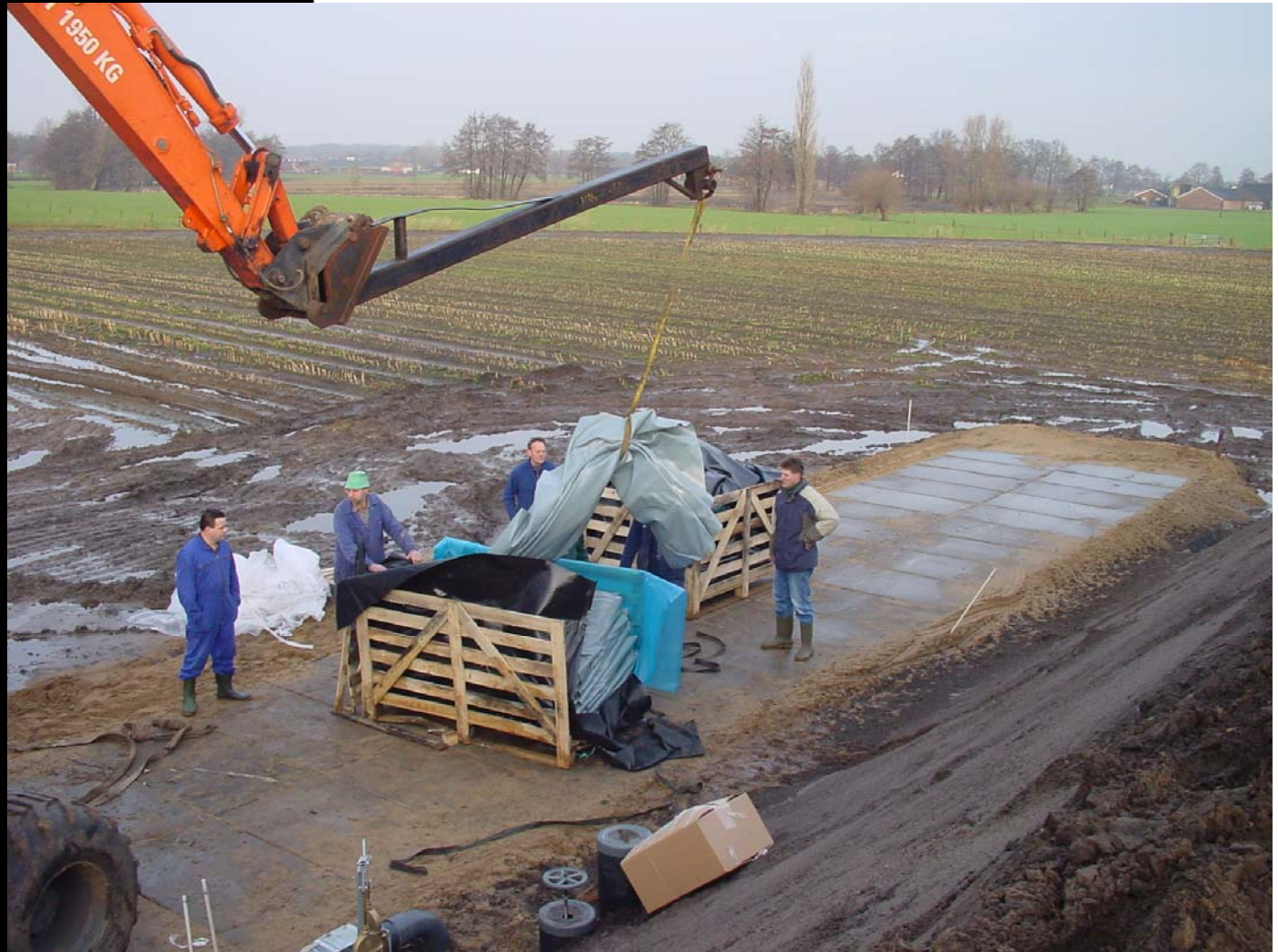
Unloading the Fecatex sheet from the crate