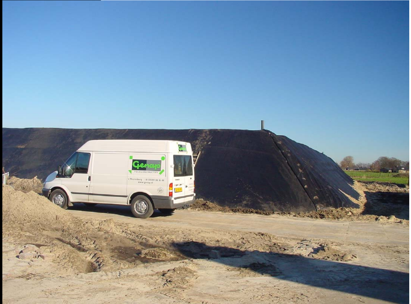
Finished reservoir with bank protection