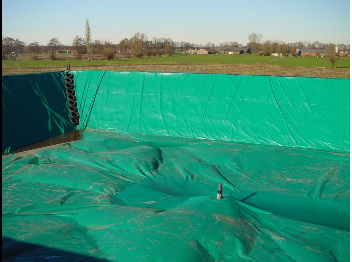
Top sheet and connection to the floating cushion