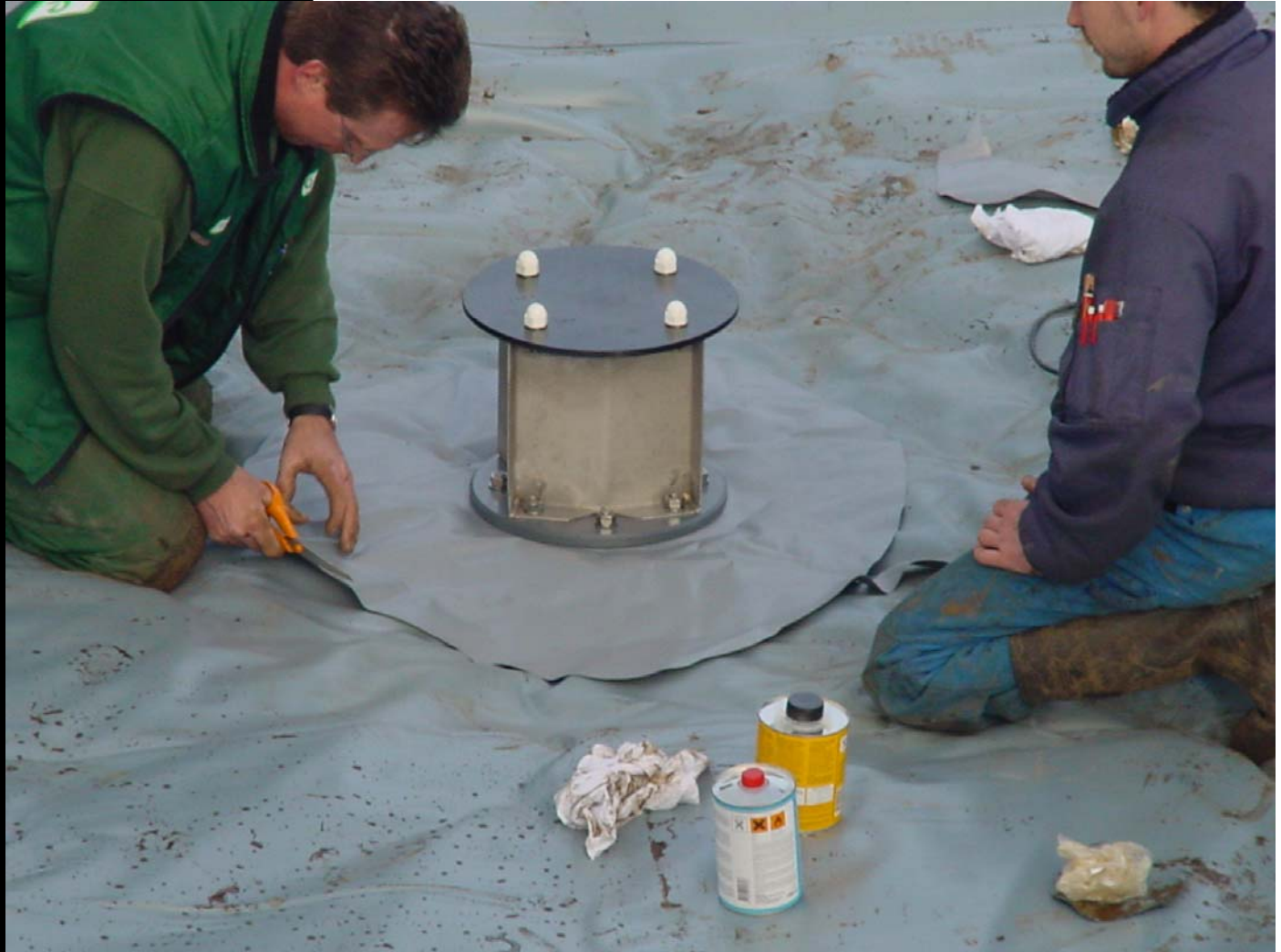
Sealing the Genatex 850-flap to the bottom liner