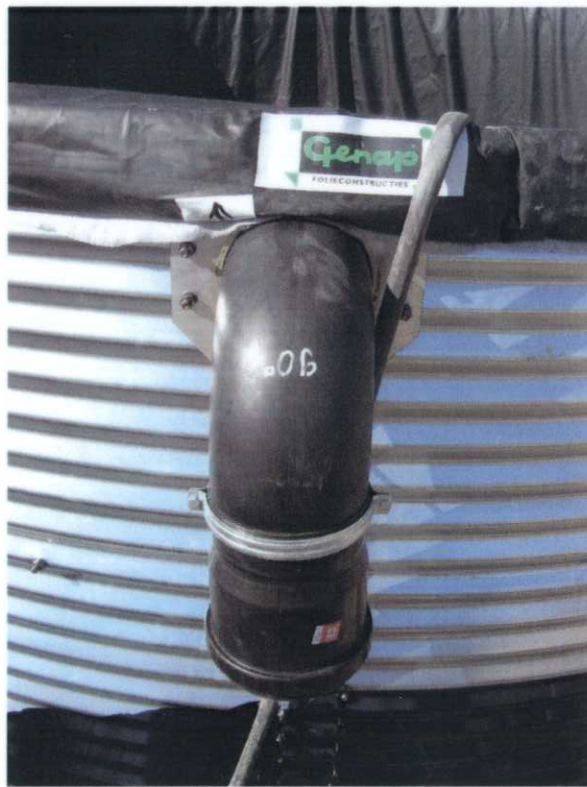
Pipe-connection to sidewall