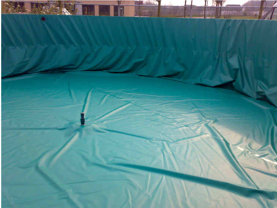
Fig.1-Closed liner system short after installation; deventing unit central in the floating cover and overflow in the tank wall.