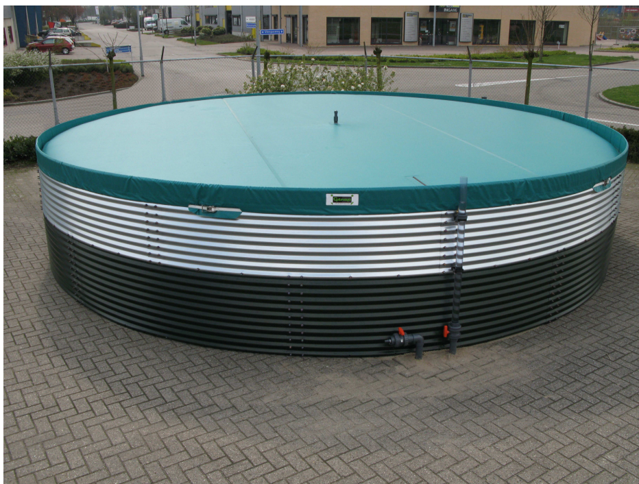
Fig.2-Closed liner system (GenaFlexstore®)