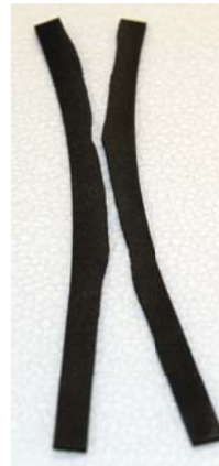
Competitor's EPDM Membrane

Lifetime Material Warranty Available (See website for details.)