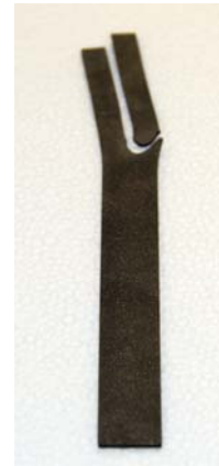
Carlisle's GeoTough EPDM Membrane

SCAN HERE TO VIEW THE J-TEAR TEST COMPARISON VIDEO